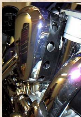
The finished product...